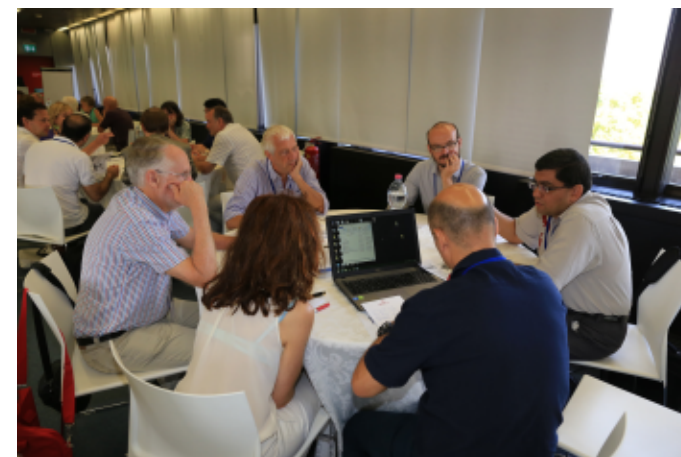
Delegates at ICSV22 Project Fair.