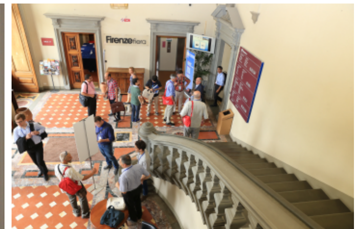
ICSV22 delegates at Firenze Fiera Congress Centre.