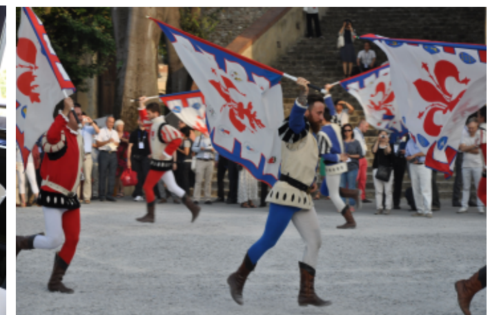
Display of flags at the Fortezza da Basso before the ICSV22 Gala Dinner.